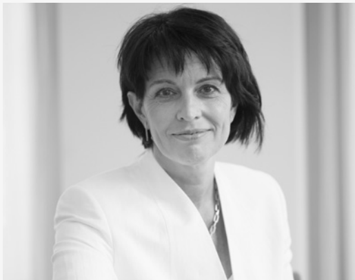
Doris Leuthard Jury President

The prominent main jury will determine three finalists and the winner.