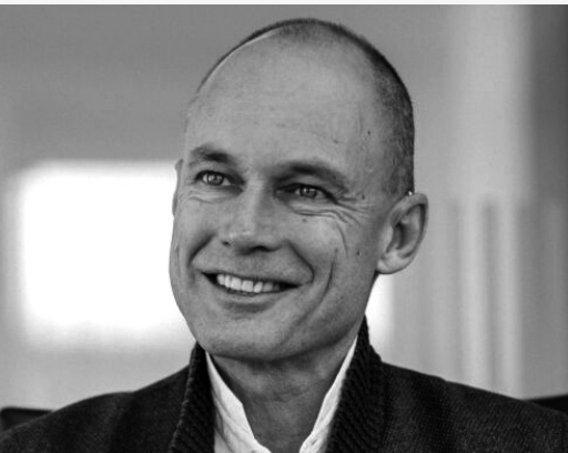
Bertrand Piccard Founder and Chair Solar Impulse Foundation